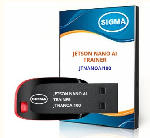
Software OS, Drivers, Codes

Sigma Trainers and Kits E-113, Jai Ambe Nagar, Near Udgam School, Thaltej, AHMEDABAD - 380054. INDIA.