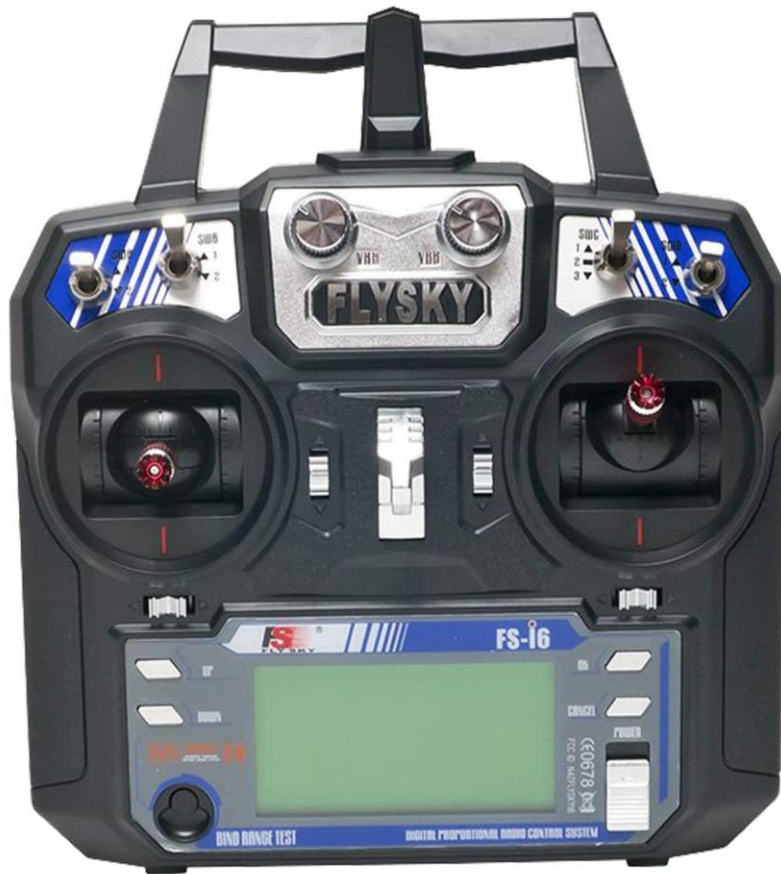
Radio Transmitter and Fs Ia6 Receiver