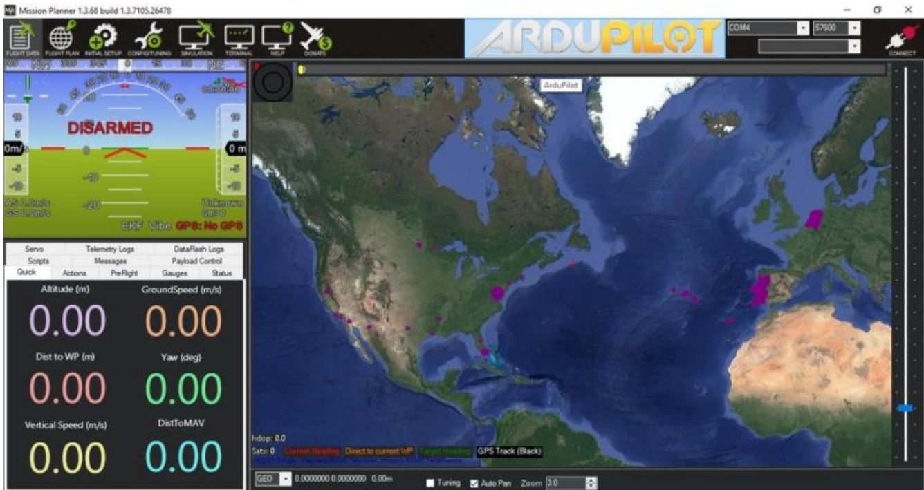
Mission Planer – ArduPilot - Software